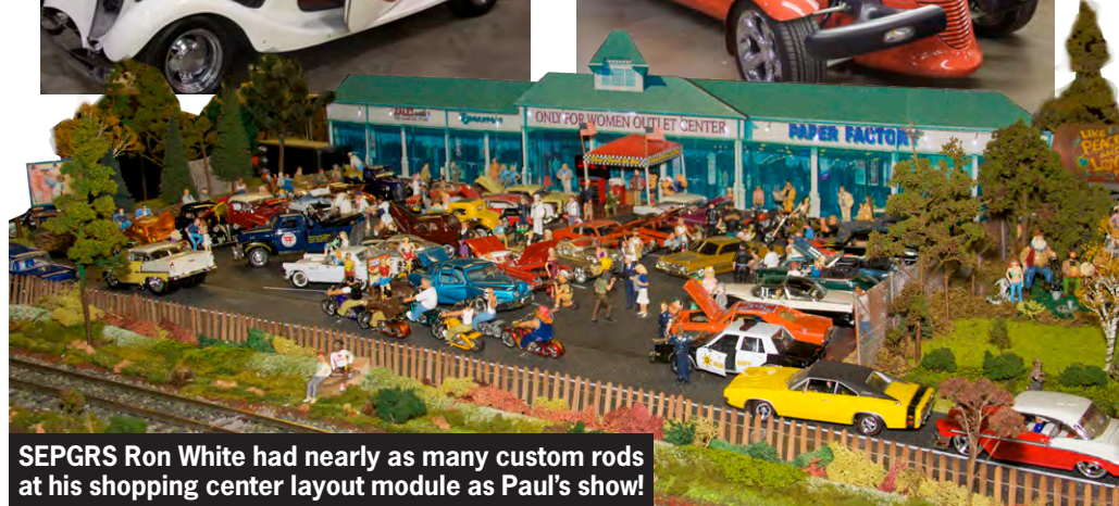
SEPGRS Ron White had nearly as many custom rods at his shopping center layout module as Paul's show!